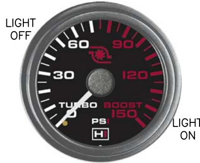
P/N 102-105-3W-1 SCALE: 3/4