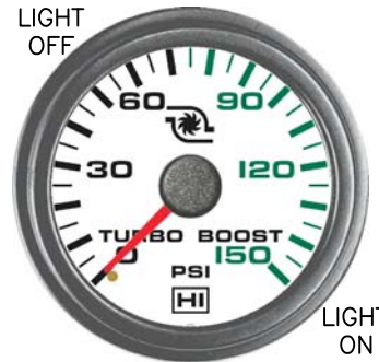
P/N 102-105-2R-1 SCALE: 3/4

DIAL FACE COLORS POINTER COLOR BEZEL COLOR & STYLE