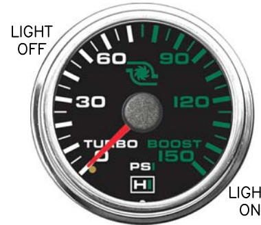
P/N 102-105-4R-2 SCALE: 3/4