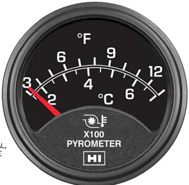
P/N 010-405-1R-1 SCALE: 1/1

This document involves CONFIDENTIAL proprietary design rights of HEWITT IND. and all designs, manufacturing, reproduction, use and sale rights regarding same are expressly reserved. It is submitted under a confidential relationship and the recipient agrees to assume custody and control thereof and that proprietary information contained herein shall not be reproduced or transferred to others or used for manufacturing or any other purpose without prior written permission of HEWITT IND.